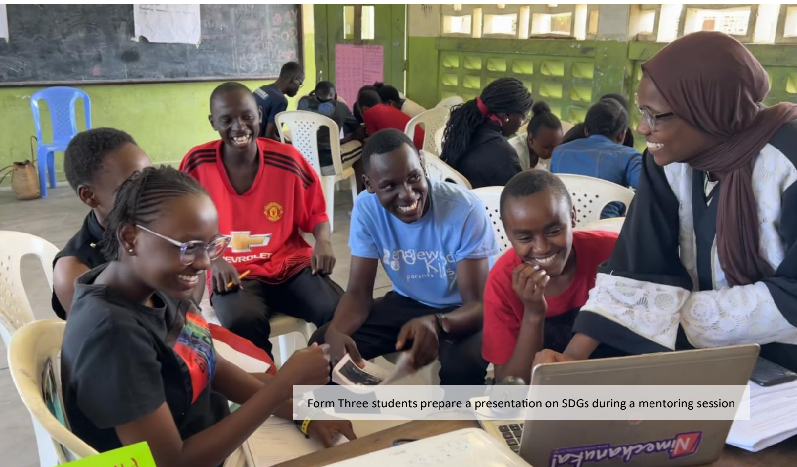
Form Three students prepare a presentation on SDGs during a mentoring session

Met or exceeded learning targets upon completing secondary mentoring