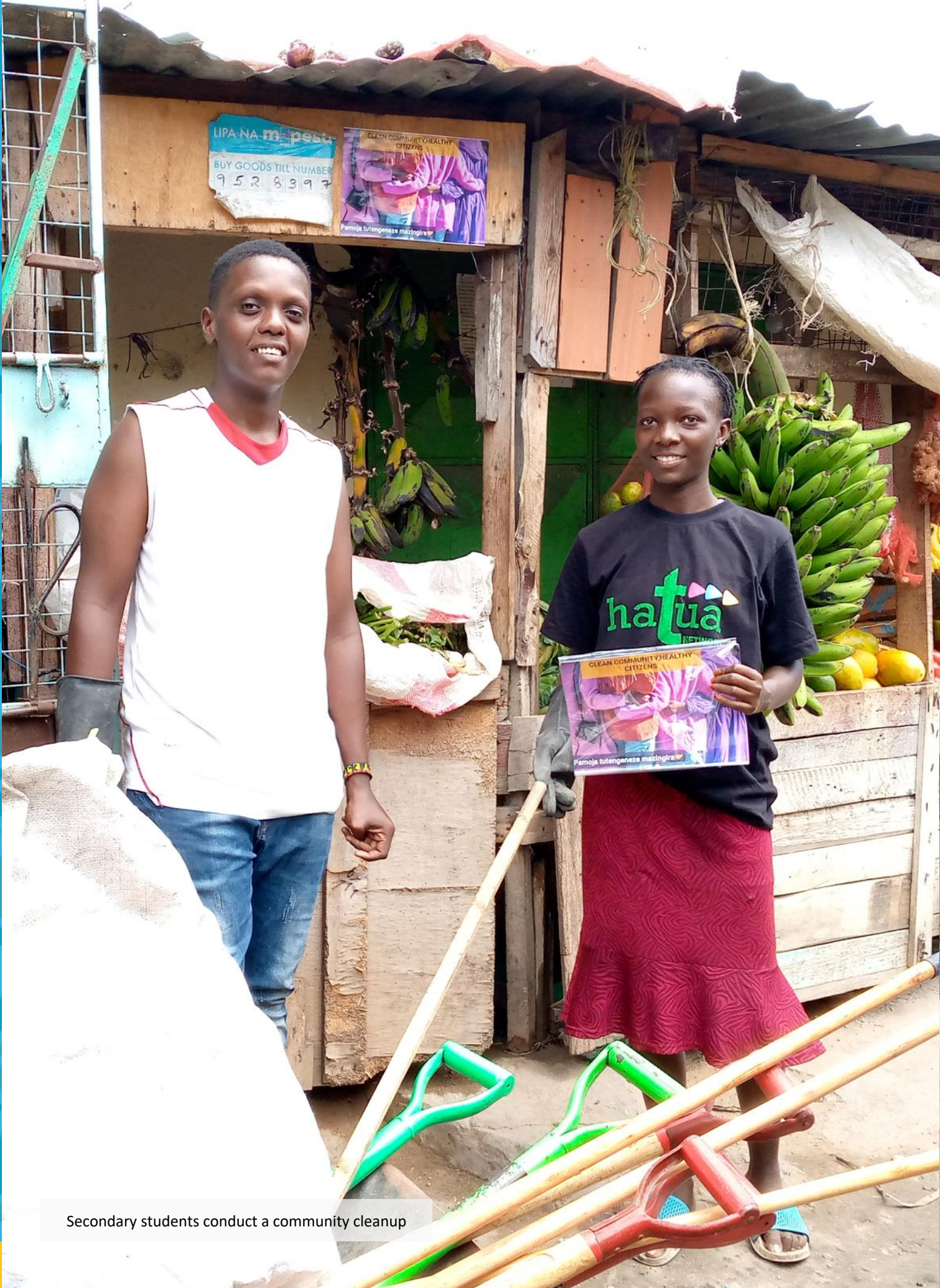
Secondary students conduct a community cleanup