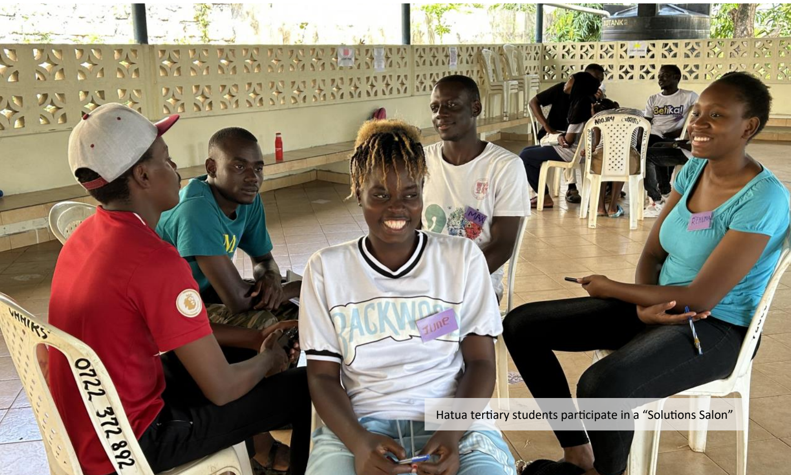
Hatua tertiary students participate in a "Solutions Salon"