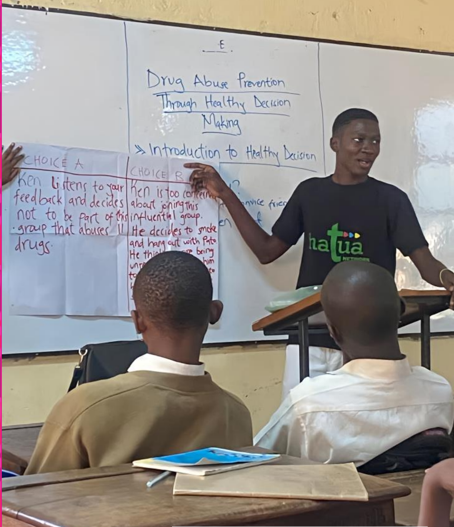
A Gap Year student leads a peer mentoring session at a Likoni high school