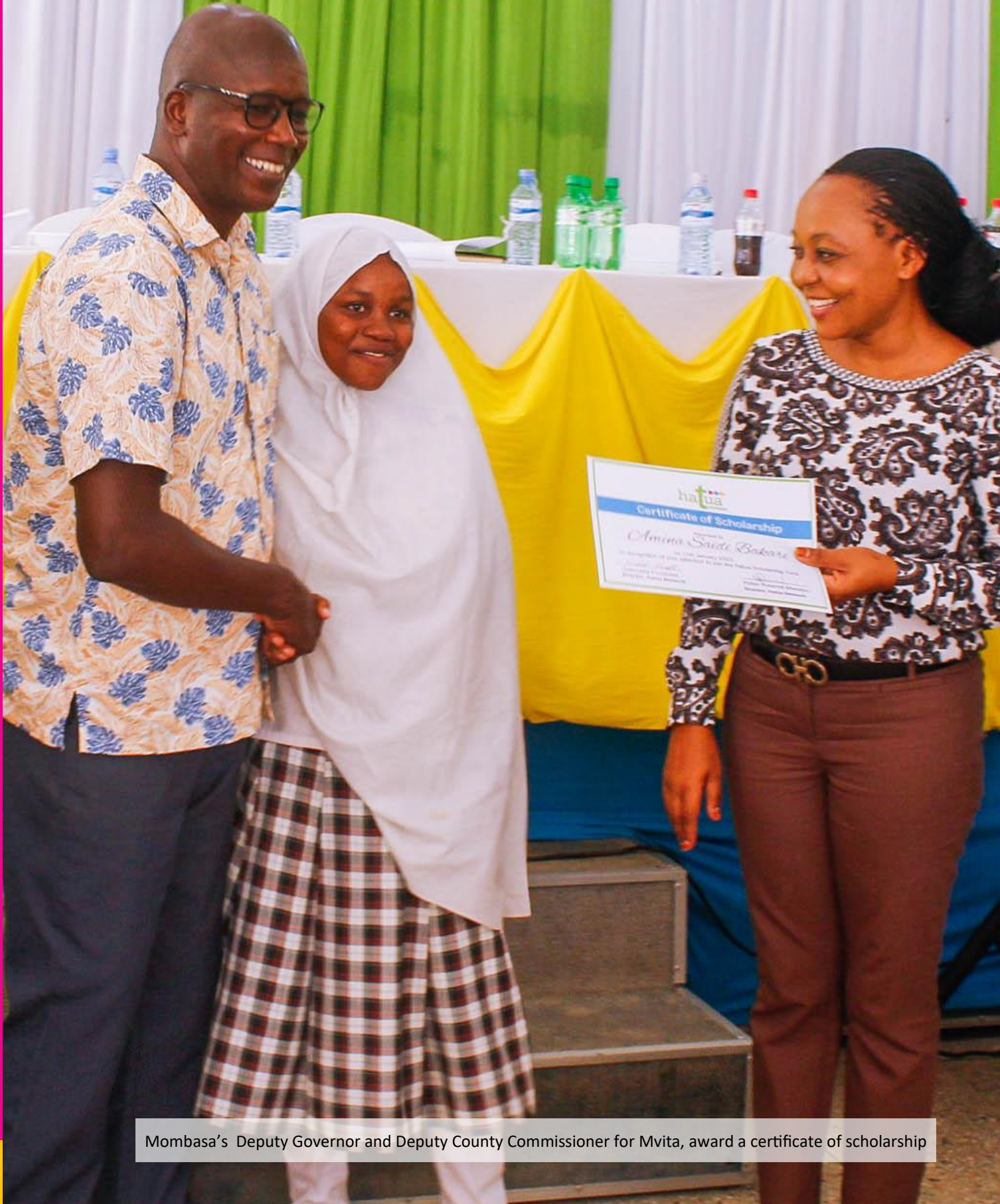
Mombasa's Deputy Governor and Deputy County Commissioner for Mvita, award a certificate of scholarship