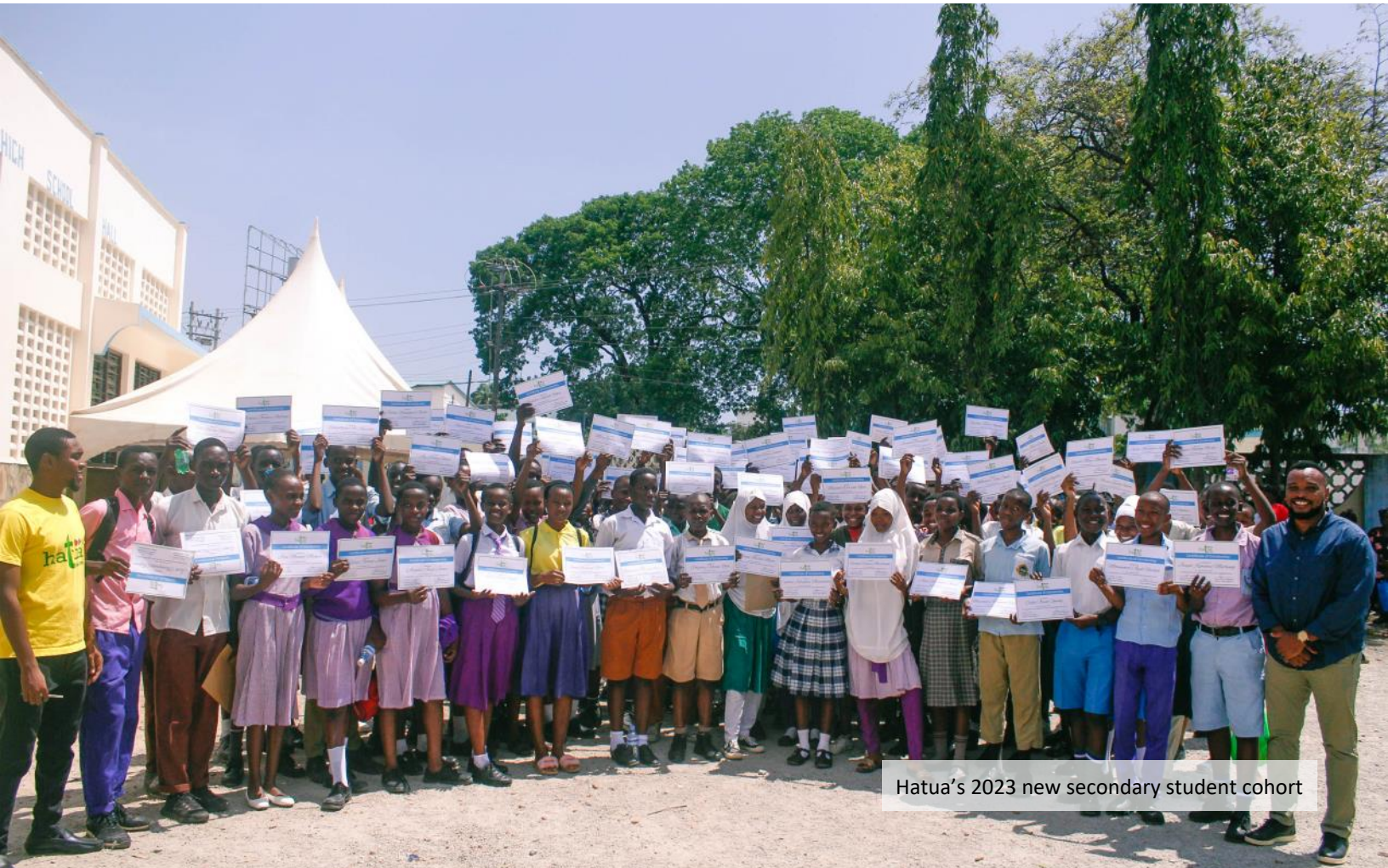
Hatua's 2023 new secondary student cohort