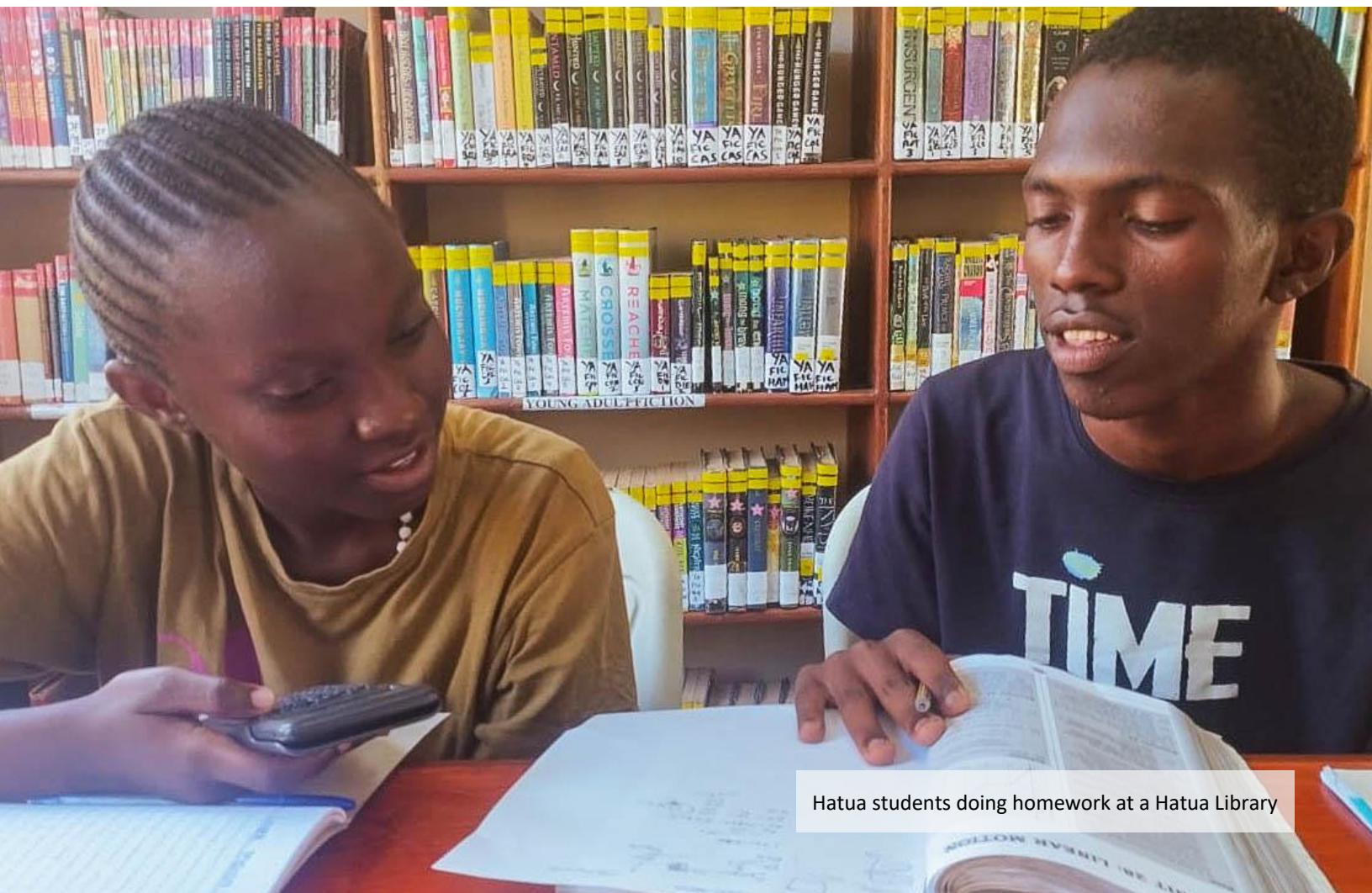
Hatua students doing homework at a Hatua Library