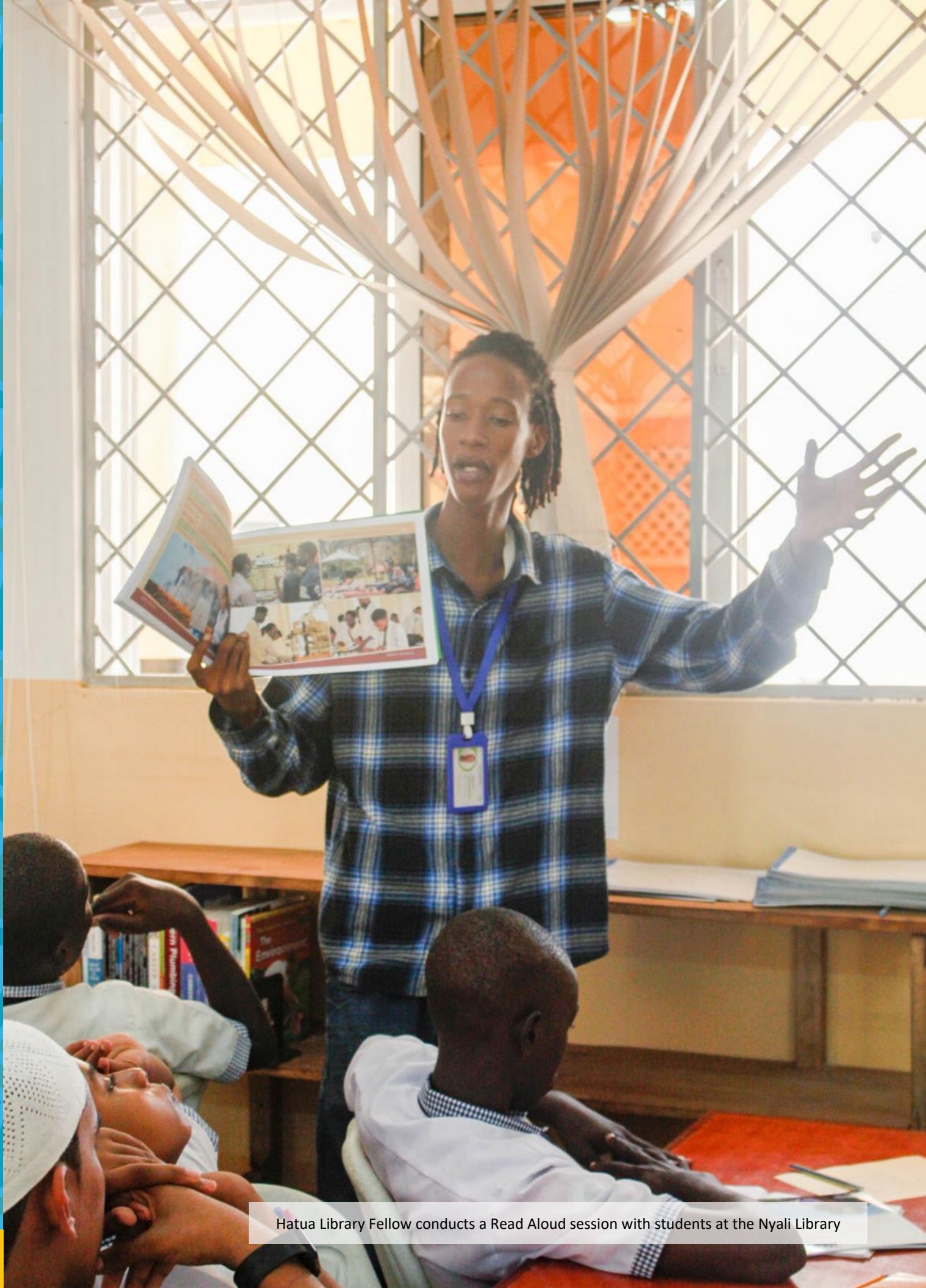
Hatua Library Fellow conducts a Read Aloud session with students at the Nyali Library