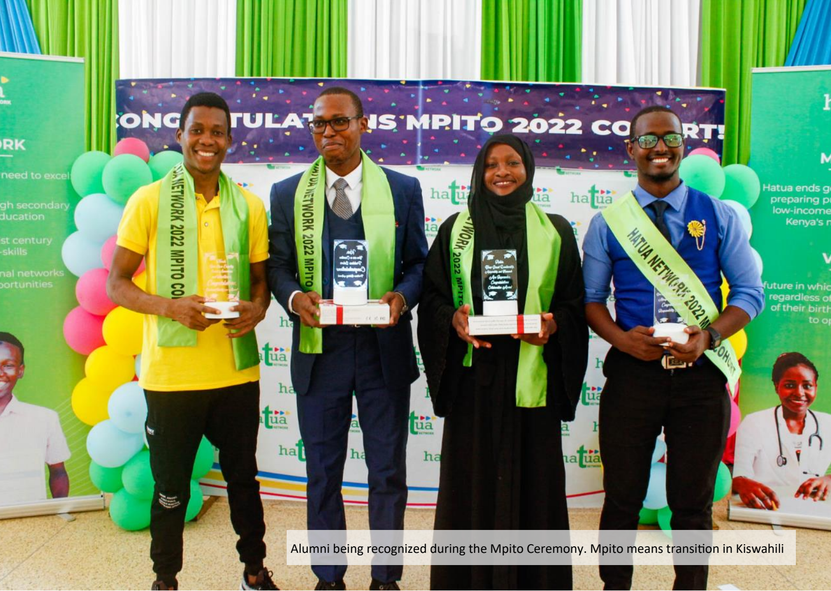
Alumni being recognized during the Mpito Ceremony. Mpito means transition in Kiswahili