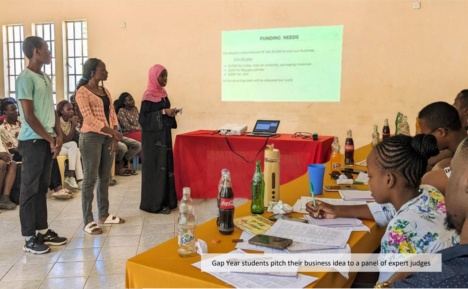
Gap Year students pitch their business idea to a panel of expert judges